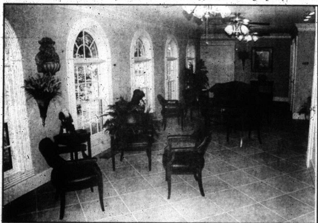
Our new solarium lounge offers a quiet peace of solitude with healing views of nature